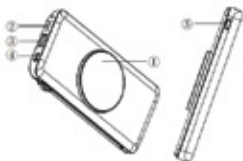
PPBCHA2681 - 8in1 Power bank